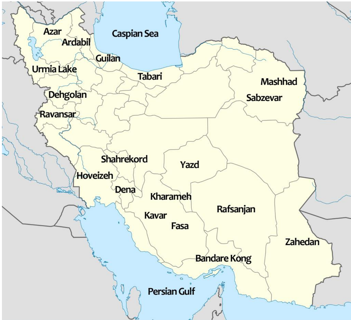
Figure 1. PERSIAN Cohort Sites